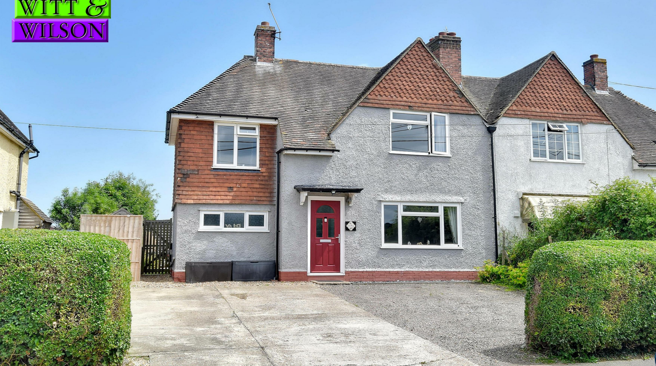
7 Oxney Cottage , Stone, Tenterden, Kent TN30 7JL Offers In The Region Of £375,000 Freehold